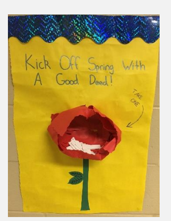
Good Deed Rose