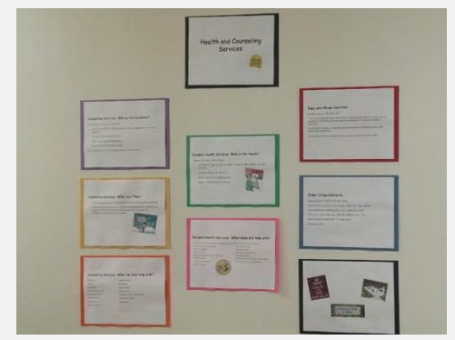
Student Health and Counceling