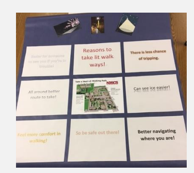
Taking a Lit Path