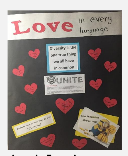
Love In Every Language

For this program, find a way to get residents to express themselves and show who they are. We want everyone to learn about each other's cultures and celebrate our differences!